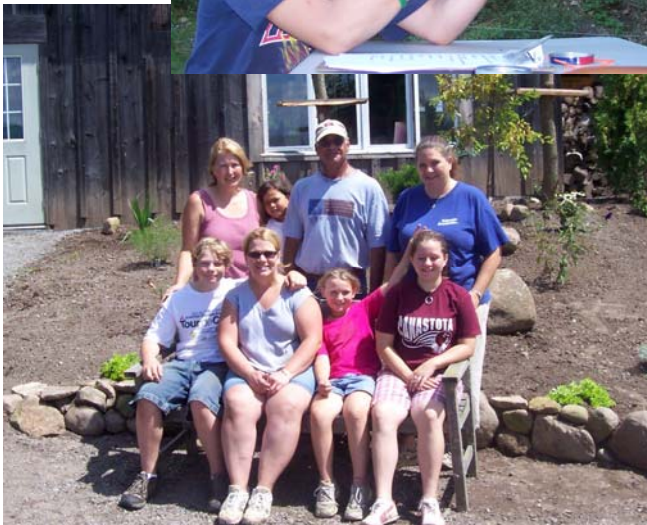
The above pictures show the Shooting Stars 4-H Club in action!!