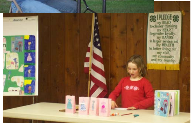
The above pictures show the Shooting Stars 4-H Club in action!!